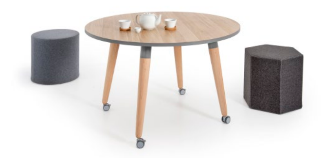
Meeting Table on Castors