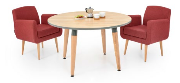
Meeting Table on Glides